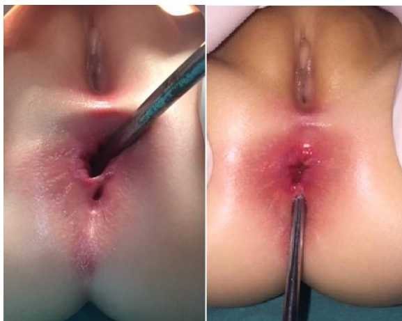
Figure 3: Submucosal saline injection.

Figure 2: Exploration with a Hegar dilator.