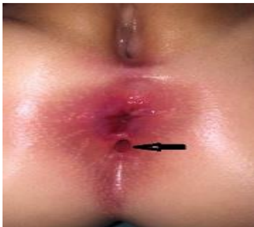
Figure 2: Exploration with a Hegar dilator.